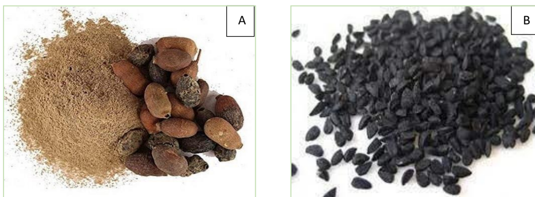
Figure 1: A. Syzygium cumini L. (seed) and B. Nigella Sativa L. (seed).

The research was carried out at the University of Development Alternative (UODA), Dhanmondi, Dhaka, at the Pharmaceutical Biotechnology lab of the Department of Biotechnology & Genetic Engineering, between September 2015 and June 2016. Seed collection of Nigella Sativa L. and Syzygium cumini L. were obtained from a Dhaka's local market. Then they were cleaned and dried in the direct sunlight. Then, until extraction, the seeds of were powdered in a household blender and stored at room temperature in an airtight container.