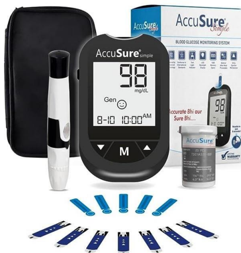
Figure 3: Glucometer used for the measurement of blood glucose level.

The measurement of blood glucose levels is done with a device called a glucometer. The glucometer will interact with a mouse's blood drop using a test strip (Model: AccuSure Instant Digital Simple Glucometer Kit). The meter shows the amount of glucose in mg/dl or mmol/L following a chemical reaction. With only a tiny amount of blood required, this tiny, portable device tests blood glucose levels swiftly, simply, and economically.