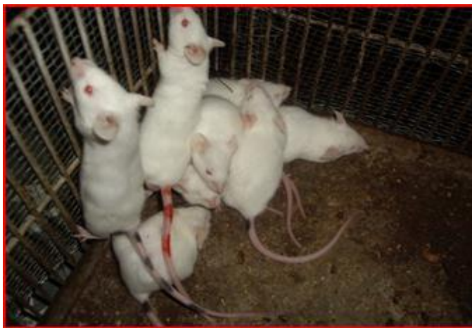
Figure 2: Experimental Animal (Swiss albino mice) at animal laboratory of University of Development Alternative.

A total of 40 Swiss albino mice were collected from the ICDDR, B, Animal Resource Branch in Mohakhali, Dhaka. The mice were kept in steel cages @10 mice per cage and were fed corn and water. They were labeled for identification during the experiment using red, black, and blue permanent markers. The animals were selected based on their weight in order to maintain a reasonably constant average body weight across all groups.